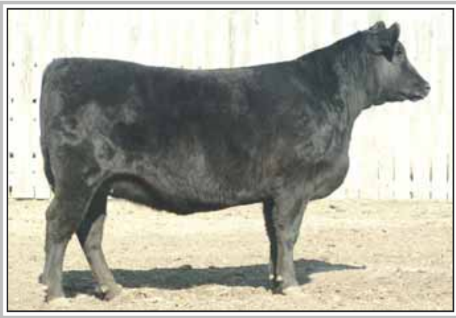
LOT 32 - PAHL 611 ANNIE K 165S