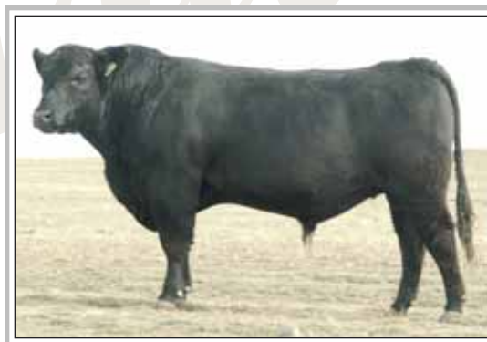
PAHL NEW DAY 152S

152S is a big, powerful New Day son and is very correct on his feet and legs. The dam goes back to Canadian Big Promise and came from the Riverbend Dispersal. She is definitely a cow that gets noticed by passers through the herd. She is not too big, but carries a lot of capacity and a picture perfect udder. All the heifers and a few cows were bred to this bull and we're really looking forward to his calves.