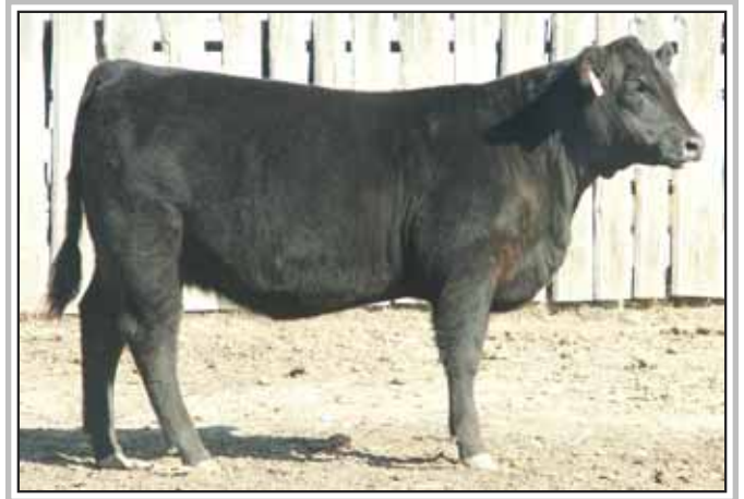
LOT 25 - PAHL 150C ANNIE K 152T

PAHL LIVESTOCK ♦ PAHL LIVESTOCK ♦ PAHL LIVESTOCK