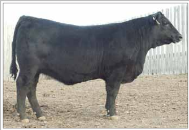
LOT 23 - PAHL QUEEN 123T