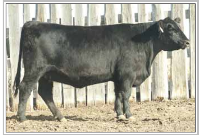
LOT 33 - PAHL RUBY 172S