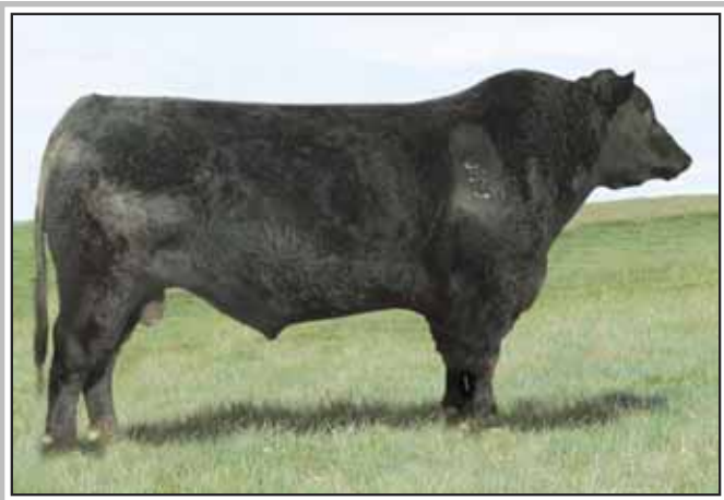
HI DIAMOND GREENSTONE 504 - SIRE OF LOTS 29, 31 & 34