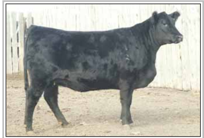
LOT 29 - PAHL QUEEN 127S