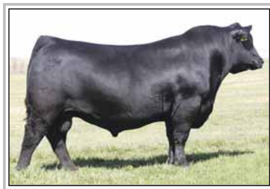
S A V NEW WORTH 4200 SIRE OF LOTS 23, 24 & 25

Mc Bee WMR Super X 745, a popular "outcross and curve bender" sire from the Genex program. His calves made a smash hit at the 2001 Midland Bull Test with his top-selling sons. Super X 745 is out of a powerful Pathfinder cow, a bull with moderate birth weight and high performance.